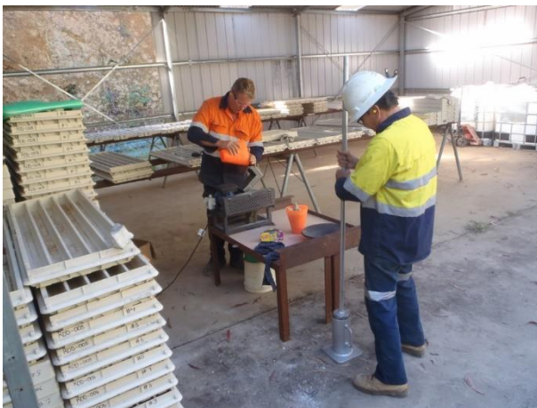
Photo 4. Geologist crushing face samples, allowing an immediate assessment of the likely grade of the sample for decision making.