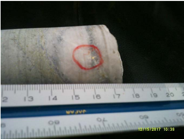
Plate 3 - Hole ROD 020B at 8 metres