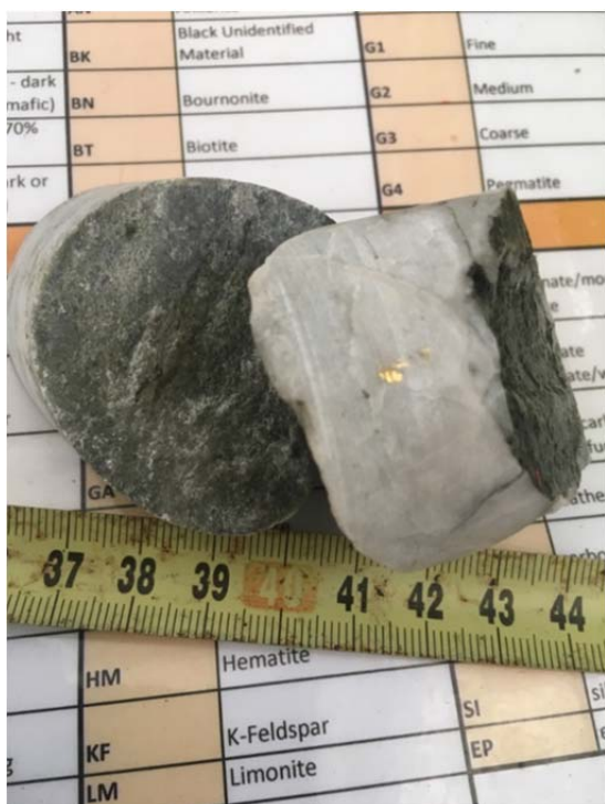
Plate 1 - Visible gold in drillcore from 16m down hole ROD 012A