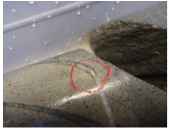
Photo 3 Hole ROD 007 - Visible Gold at 1.0 m