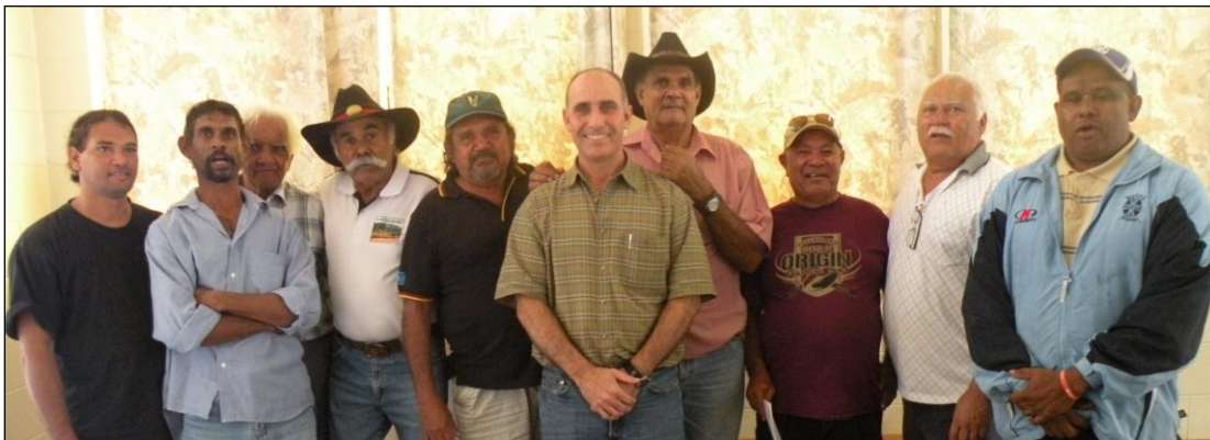
Figure 1: The Djungan People and Mantle's representatives after executing the ILUA.

Mantle Mining Corporation Limited (ASX: MNM) "Mantle", is pleased to advise that on Wednesday 18 th July 2012 the Djungan People (the relevant Native Title Parties) considered, and authorised their representatives to execute, an Indigenous Land Use Agreement (ILUA) in relation to Mantle's 100% owned Trafford Coal and Gas project in North Queensland.